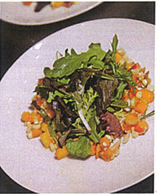
Beacon, a restaurant in Los Angeles, catered the Asian-inspired meal. Dessert was miniature cakes and pies, plus fruit.