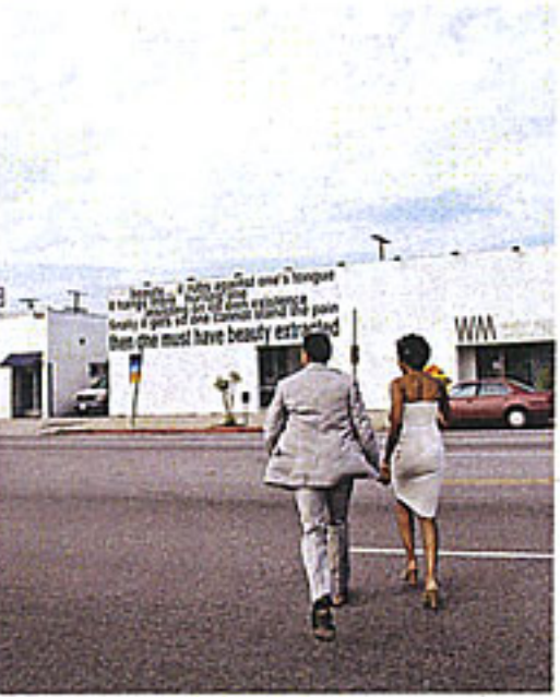
The location, the Smog Shoppe, is on an industrial stretch of La Cienega Boulevard. The couple dashed across for a photo.