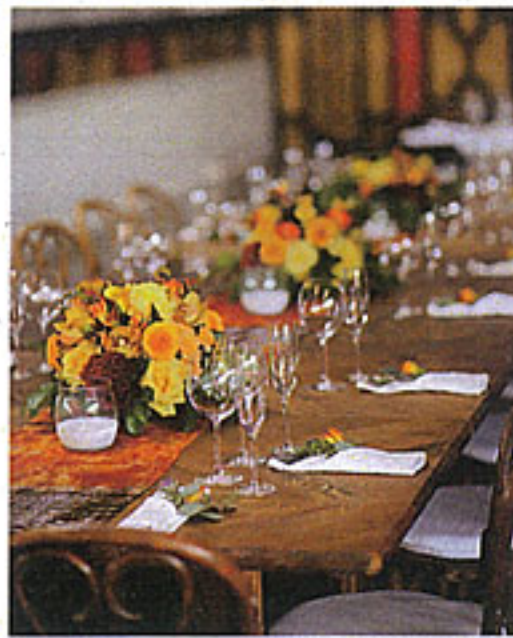
LisaGay wanted the recycled-wood tables to be seen, so she cut an earth-tone African fabric into strips for runners.